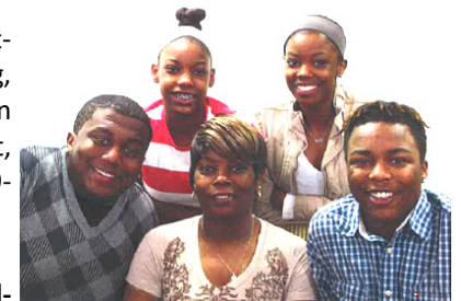
The 2018 Habitat House Family