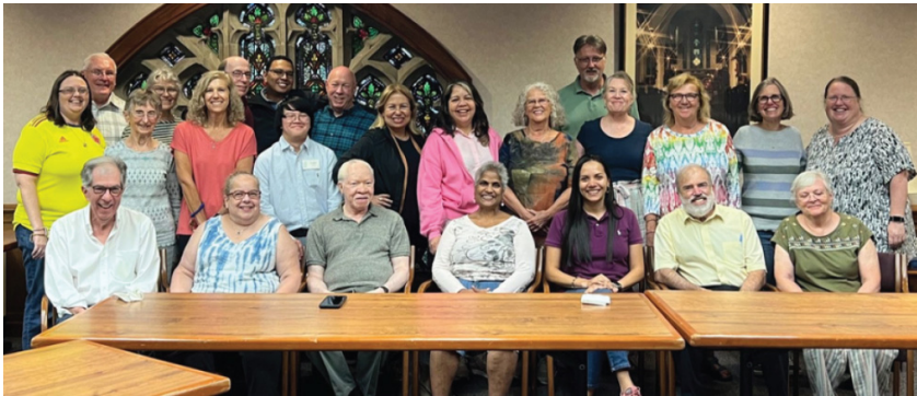
The delegation from North Coast Presbytery visits the Miami Valley 2023